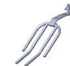
Stainless steel interior fork grate