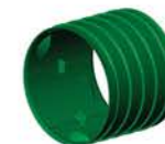
Double bell snap