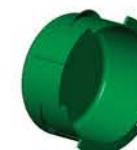
Internal end cap