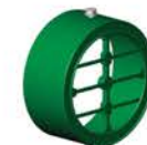
Plastic grate with large holes, reinforced with stainless steel inserts