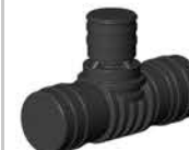
Vertical drain tee