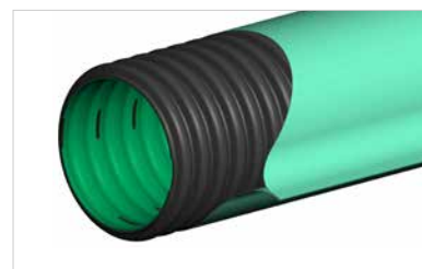
TYPE 3 - 250 microns

The Type 3 perforated drain is recommended in presence of iron ochre or when it is installed with a clean stone backfill .