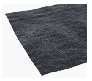
PROTECTION WOVEN GEOTEXTILE 2006W