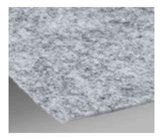
TX-90 SEPARATION NONWOVEN GEOTEXTILE