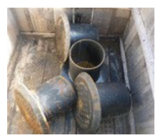
CAST IRON FRAMES AND COVERS