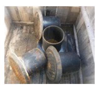
CAST IRON FRAMES AND COVERS