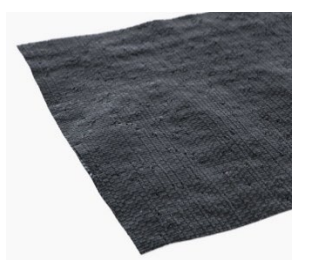
PROTECTION WOVEN GEOTEXTILE 2006W